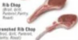
Rib Chop (Roast, Grill, Panbroil, Party, Roast)