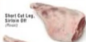
Short Cut Leg, Sirloin or Shank (Roast)