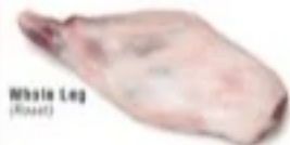
Whole Leg (Roast)