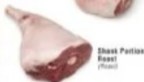
Shank Portion Roast (Roast)