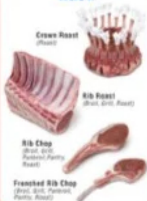
Crown Roast (Roast)