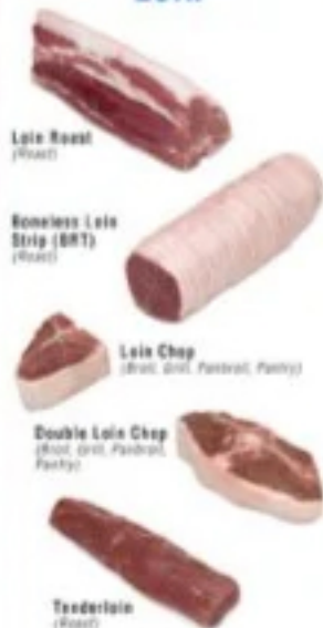
Loin Roast (Roast)