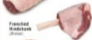
Frenched Hindshank (Roast)