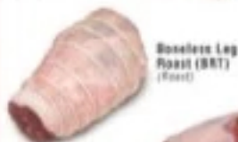
Boneless Leg Roast (BRT) (Roast)