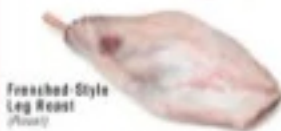
Frenched-Style Leg Roast (Roast)