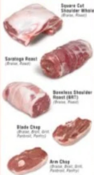
Square Cut Shoulder Whole (Roast, Roast)