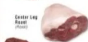
Center Leg Roast (Roast)