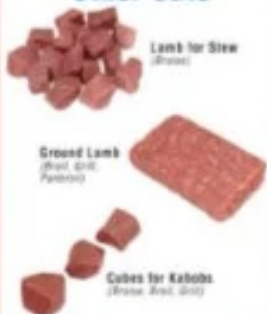
Lamb for Stew (Roast)