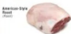
American-Style Roast (Roast)